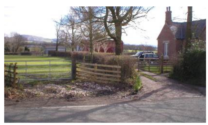
The Field Gate