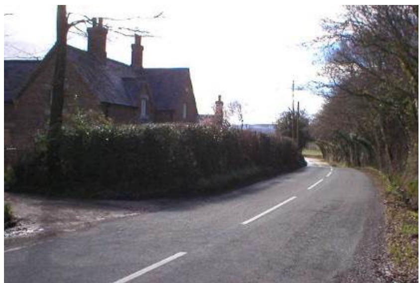
The Existing Access

access and the hedge is provided below, along with a further photograph showing the recently created field gate which will be utilised for the new access point.